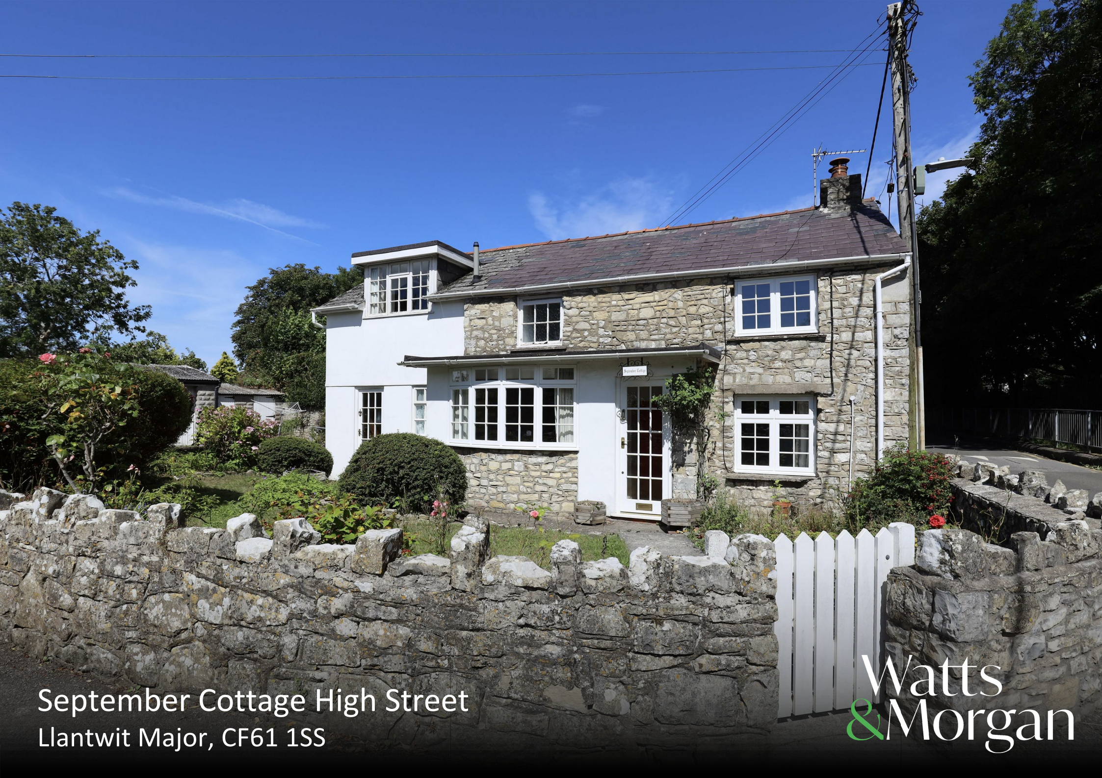
September Cottage High Street Llantwit Major, CF61 1SS